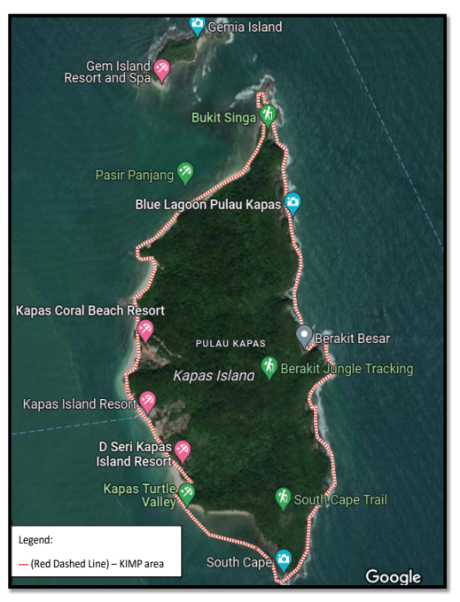
Figure 2. The map of KIMP (the whole of Kapas Island) as a research area

Adam et al. (2022) mentioned that marine areas are extremely valuable and provide numerous recreational activities for visitors. Recreational activities such as snorkelling, scuba diving, canoeing, boating, and picnicking are popular among visitors. The primary attraction for the diver is World War II remnants found five nautical miles offshore. Furthermore, squid jigging around the island is a popular recreational activity and a significant source of revenue for the local fishermen. Snorkelling is the most well-known tourism activity in KIMP (Jaafar & Maideen, 2012; Safuan et al., 2021). Due to the small island, KIMP is not a major marine park tourism destination, but it has a developed tourist market with one dive centre and fewer than 10 resorts (Reef Check Malaysia, 2021).